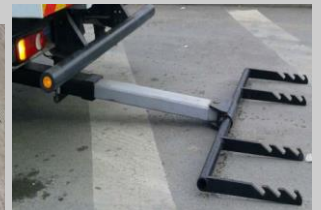
Rear Fork Attachment

AND MANY OTHER ACCESSORIES AND COMPONENTS ARE AVAILABLE