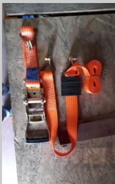
Three Point Fixation Belts